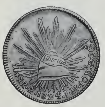
Lot No. 2501